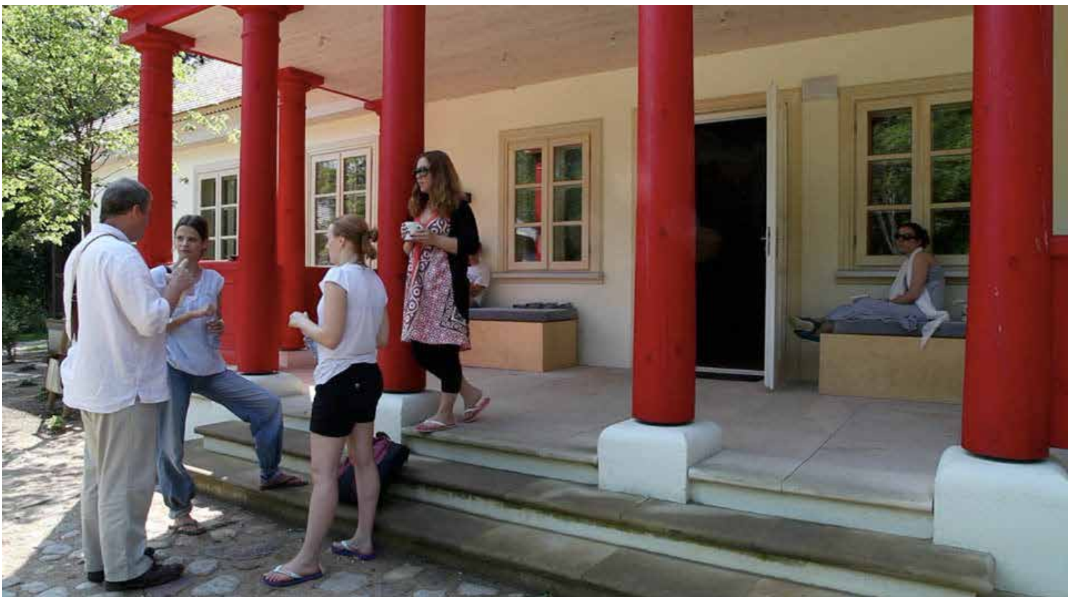
The Manor House at Krasnogruda, 2012